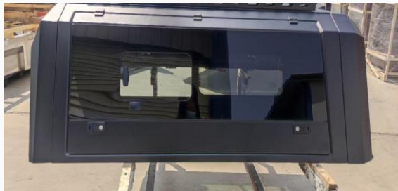
Large side window glass